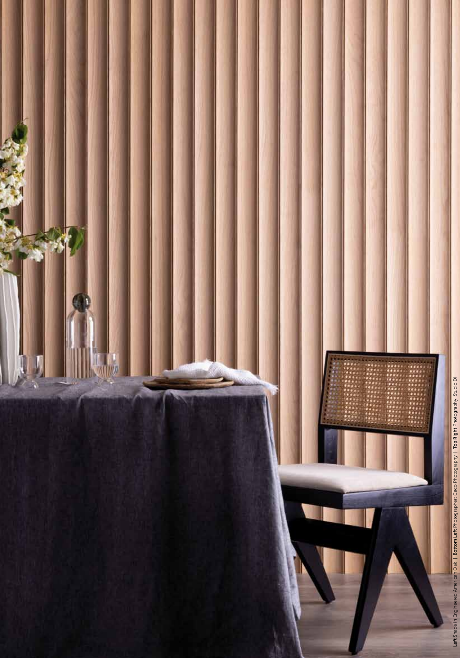
Left: Shade in Engineered American Oak | Bottom Left: | Top Right: