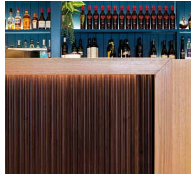
Riverine profile shown

Porta Tasmanian Oak is a beautiful Australian hardwood and forms the core of Porta's range. This Select grade timber is also versatile, featuring minimal marks and natural characteristics, resulting in a clean and strong finish.