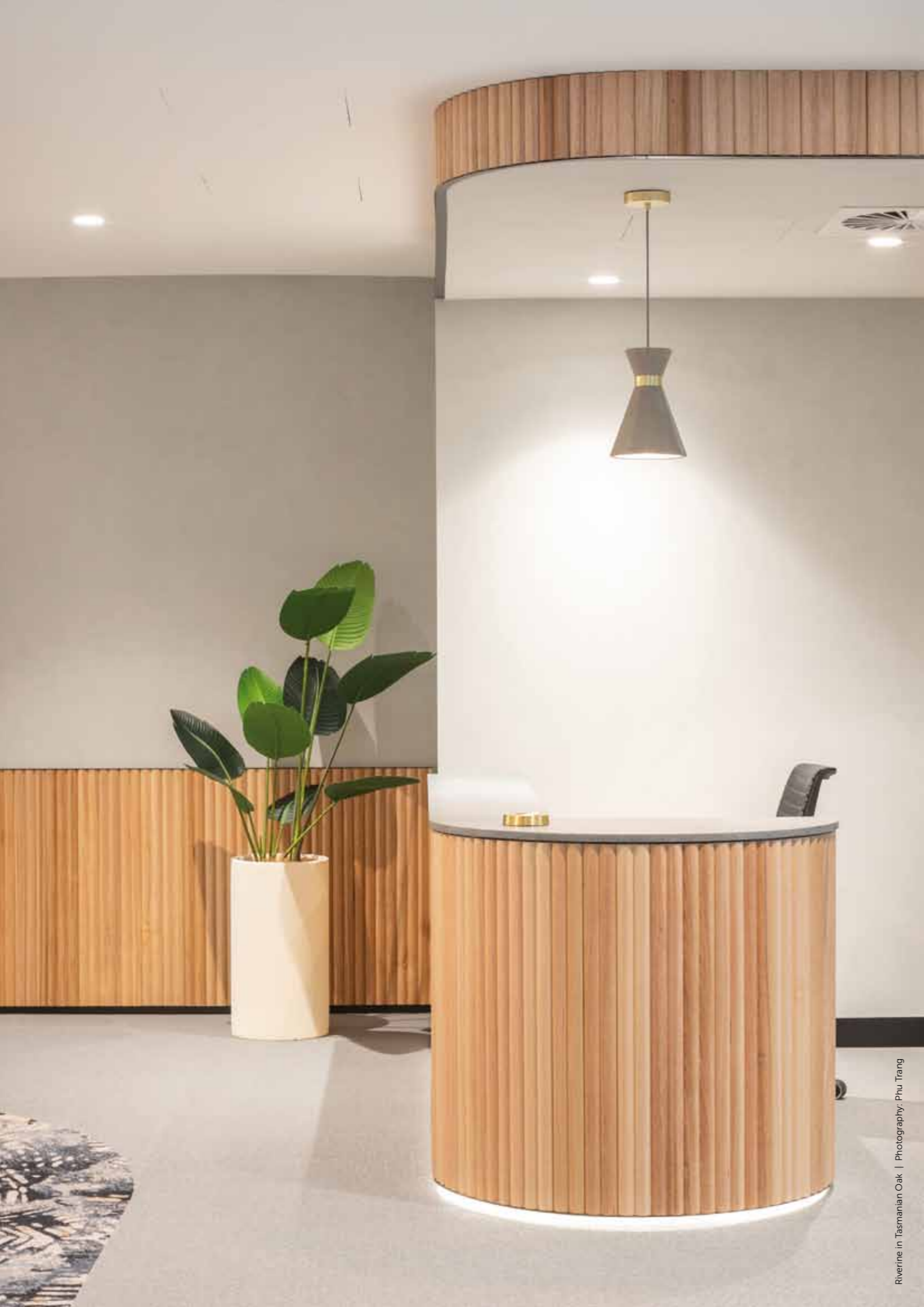
Riverine in Tasmanian Oak | Photography: Phu Trang